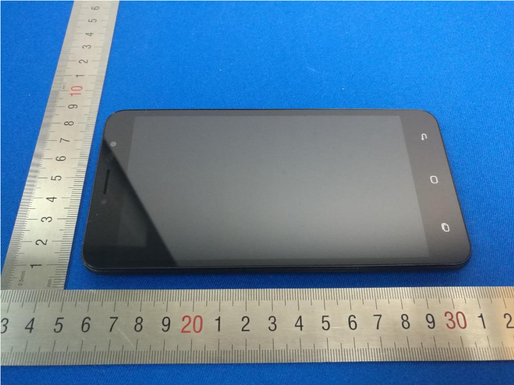
Photo for SZEM1712012782RG (Hisense T203)