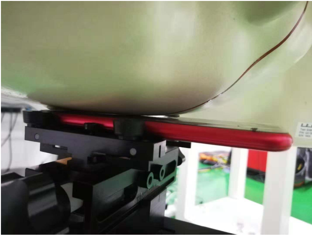
Right Head Touch Cheek Position