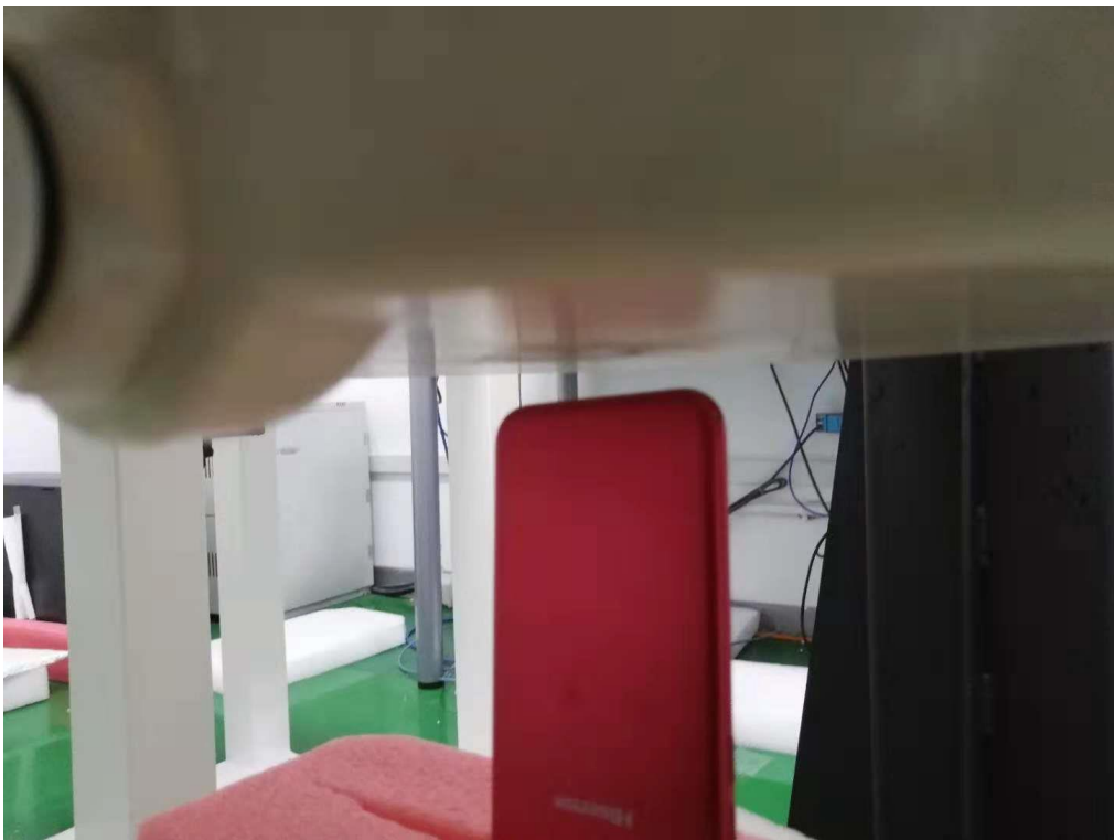
Toward Bottom (10mm)