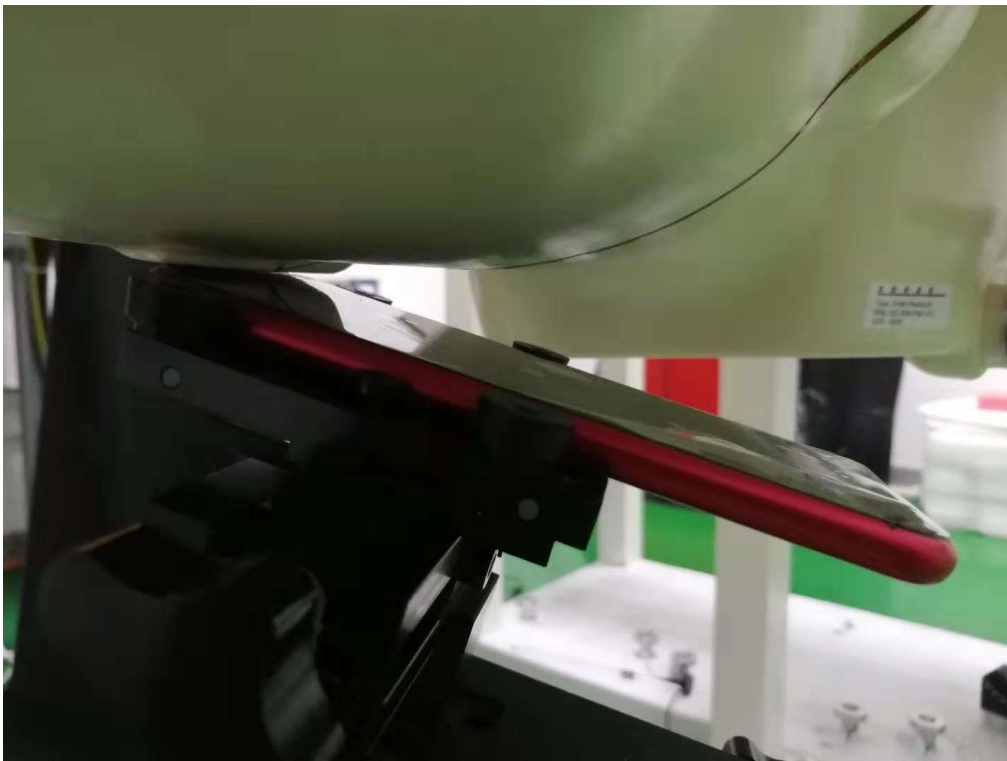
Right Head Tilt 15° Position