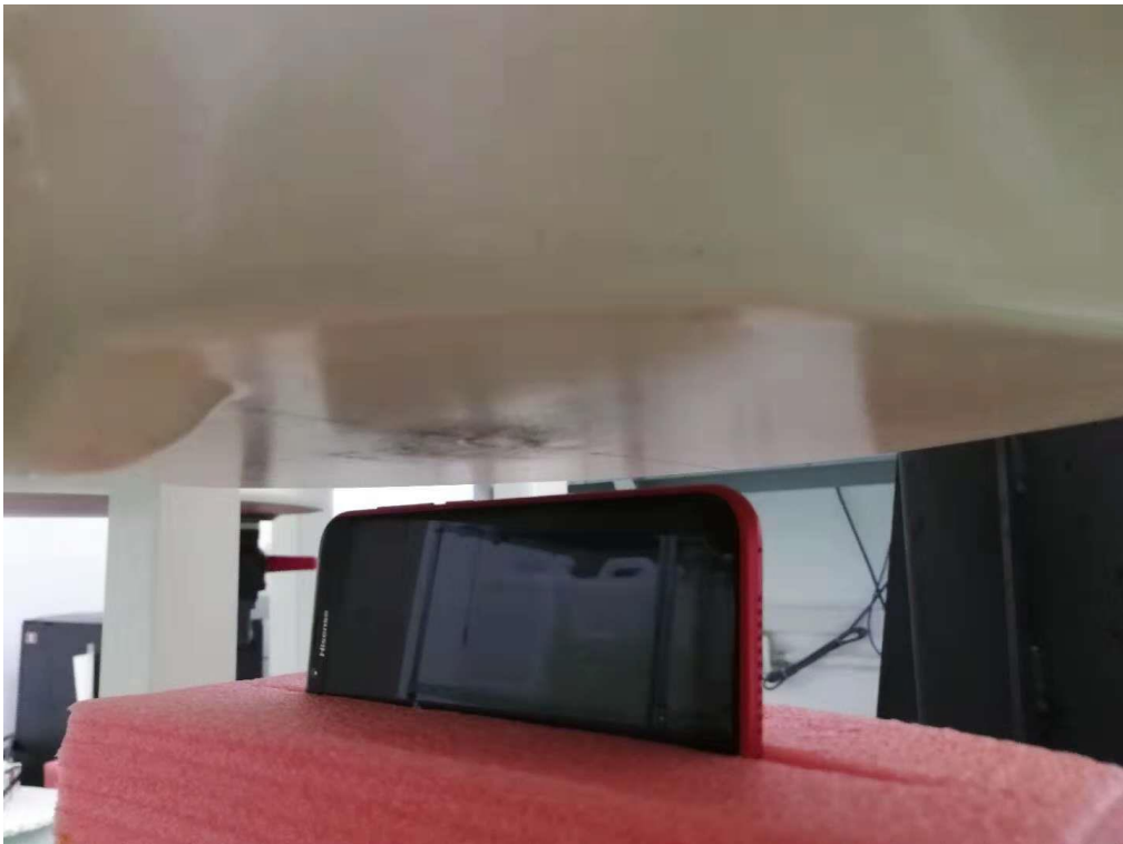
Toward Right (10mm)