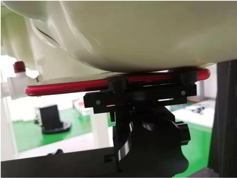
Left Head Touch Cheek Position