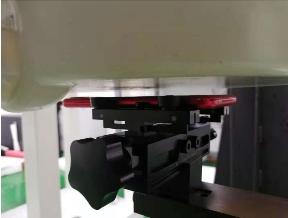
Toward Phantom (10mm)

According to the antenna position, the Body SAR is tested at the following 6 test positions all with the distance =10mm between the EUT and the phantom bottom :