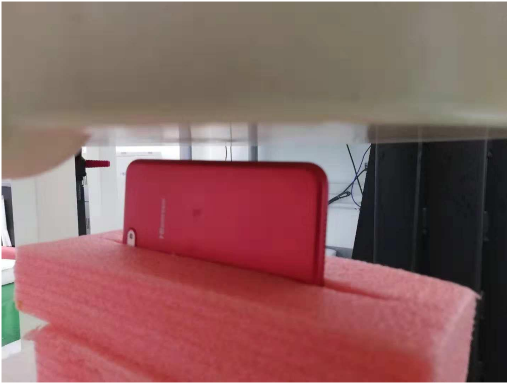
Toward Left (10mm)