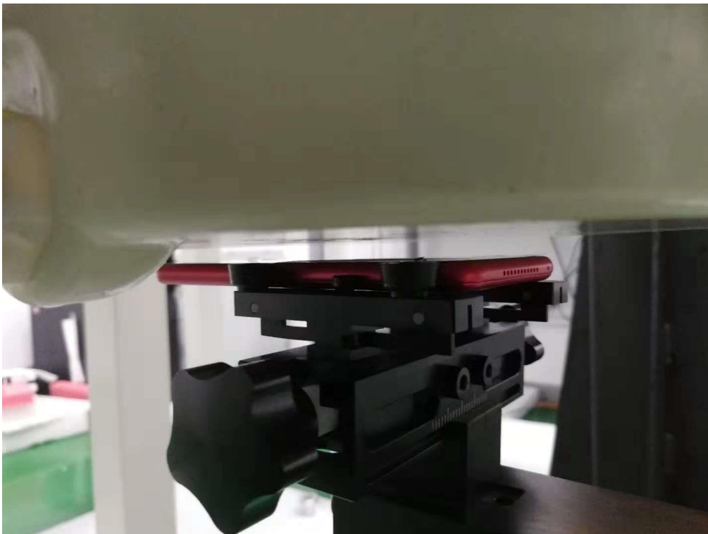
Toward Ground (10mm)