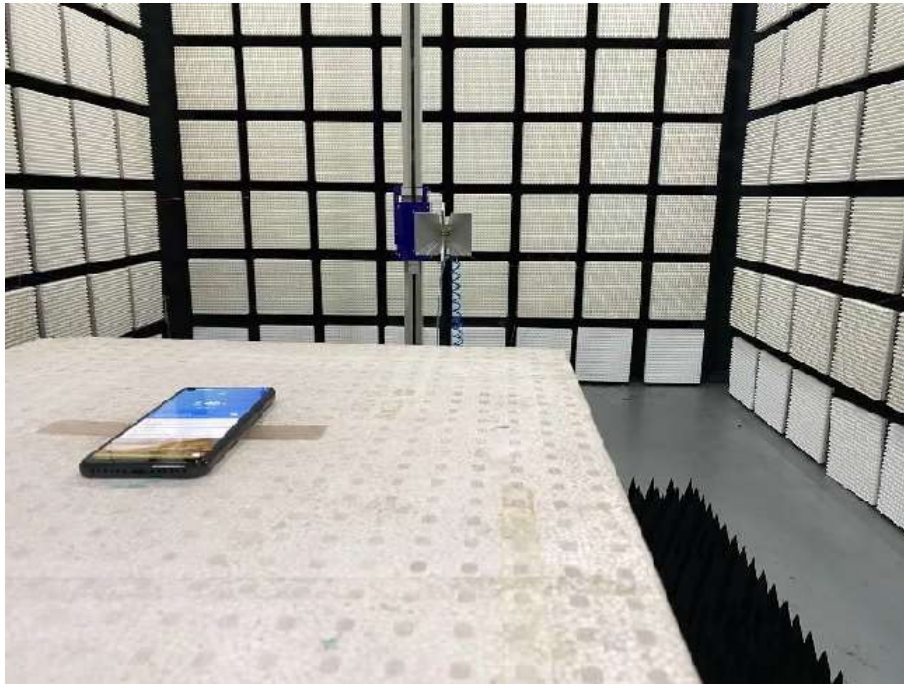
Field Strength of Spurious Radiation (1GHz - 10GHz)