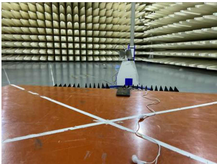
Radiated Emissions Test Setup (with charger) (above 1GHz)