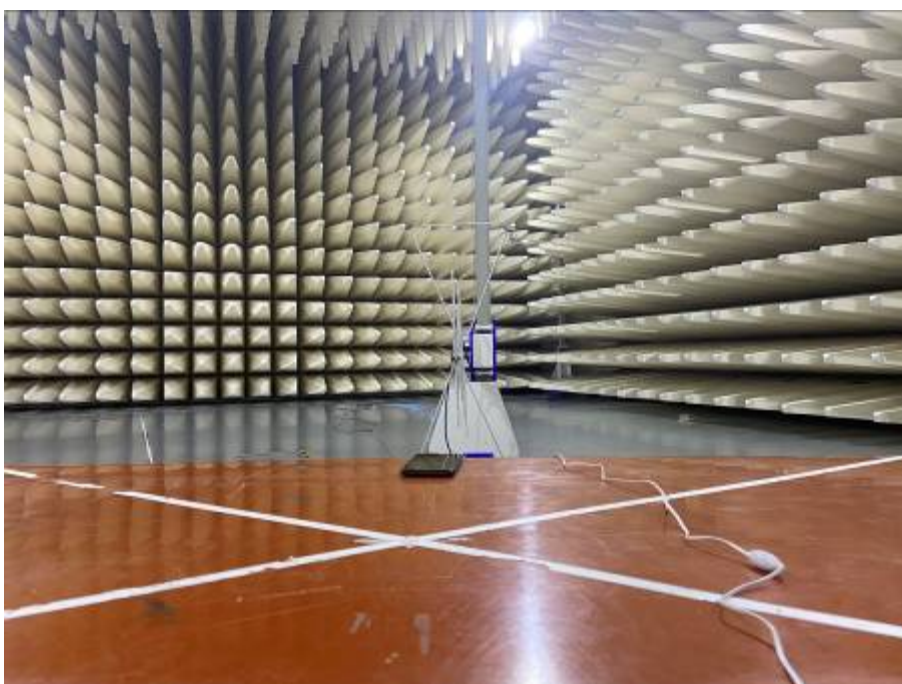
Radiated Emissions Test Setup (with charger) (30-1000MHz)