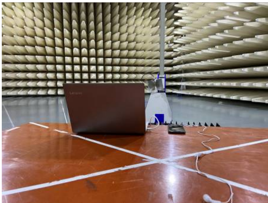
Radiated Emissions Test Setup (with laptop) (above 1GHz)