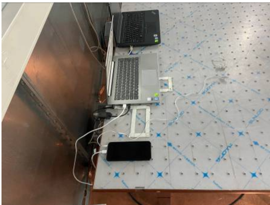
Conducted Emissions Test Setup (with laptop)