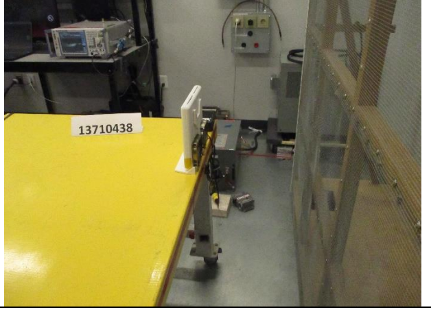
AC LINE BACK PHOTO