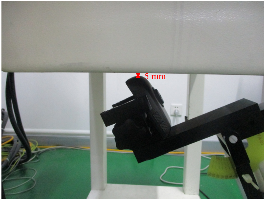
Body Bottom Setup Photo