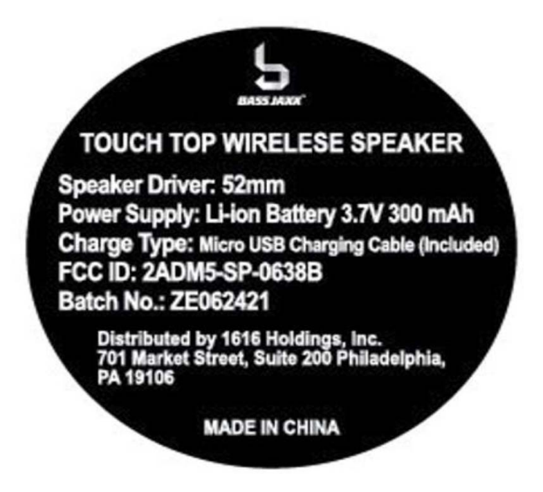
FCC ID Label Location Information