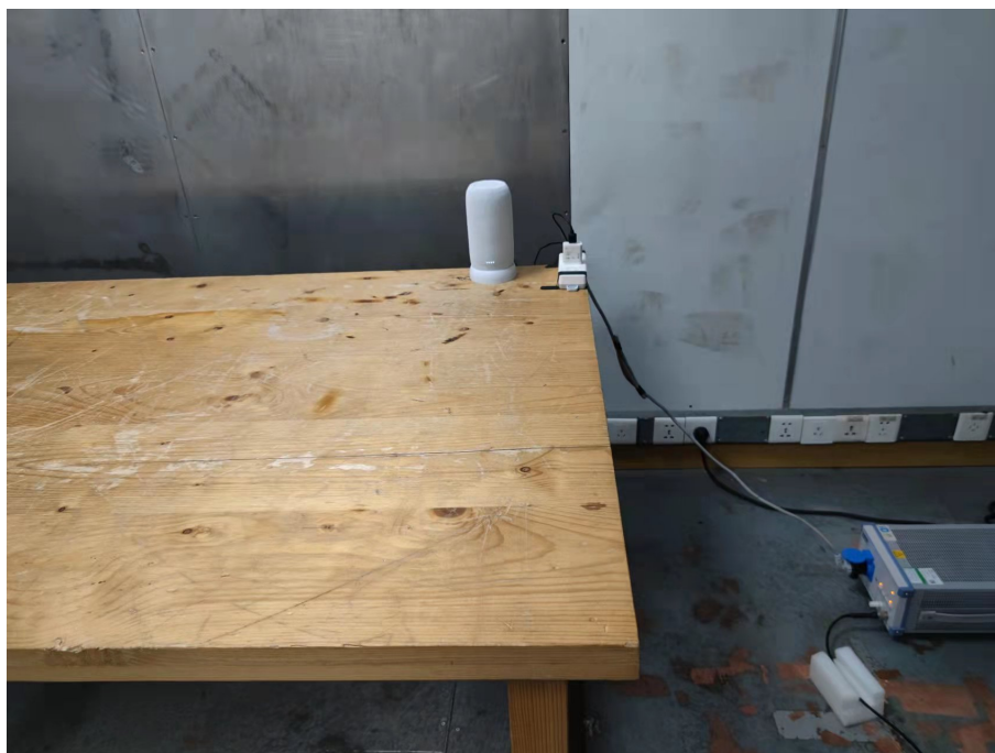
Photo of Conducted Emission Measurement