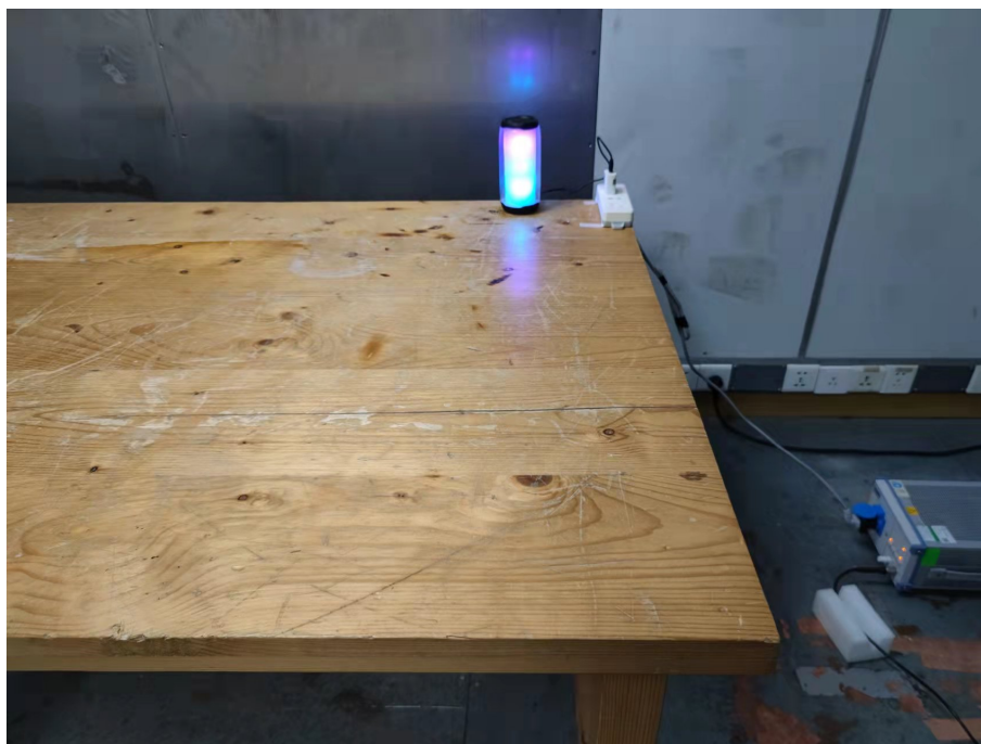
Photo of Conducted Emission Measurement