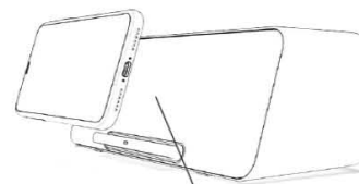
Wireless charging area