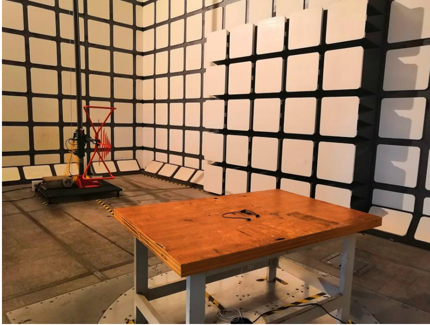
Radiated Emissions View (Above 1 GHz)