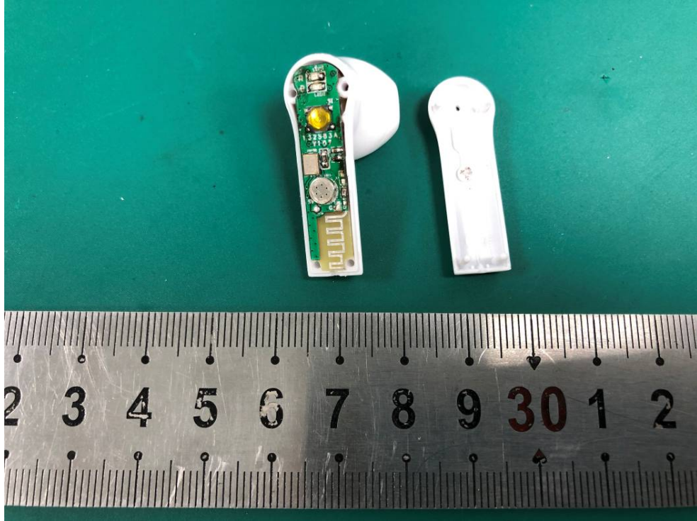
EXHIBIT C - EUT INTERNAL PHOTOGRAPHS