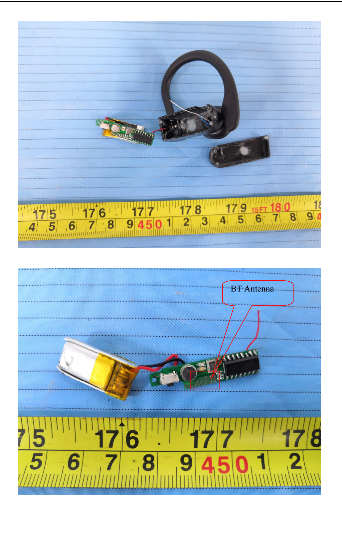
EXHIBIT C - EUT INTERNAL PHOTOGRAPHS