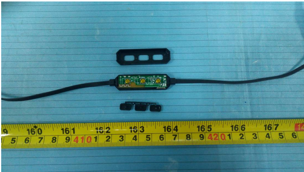
EUT – Cover off View 2