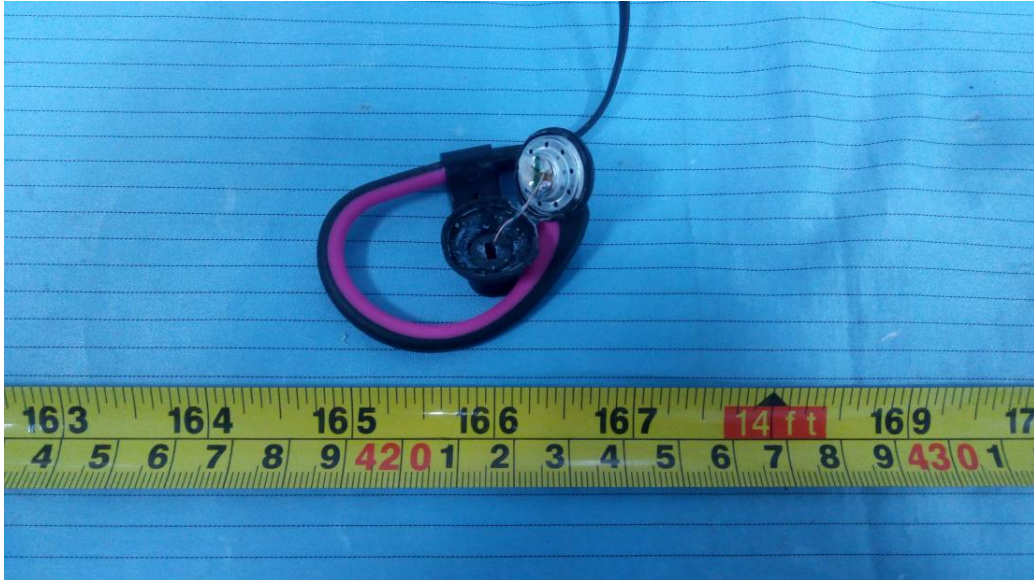
EUT –Right Ear Cover off View