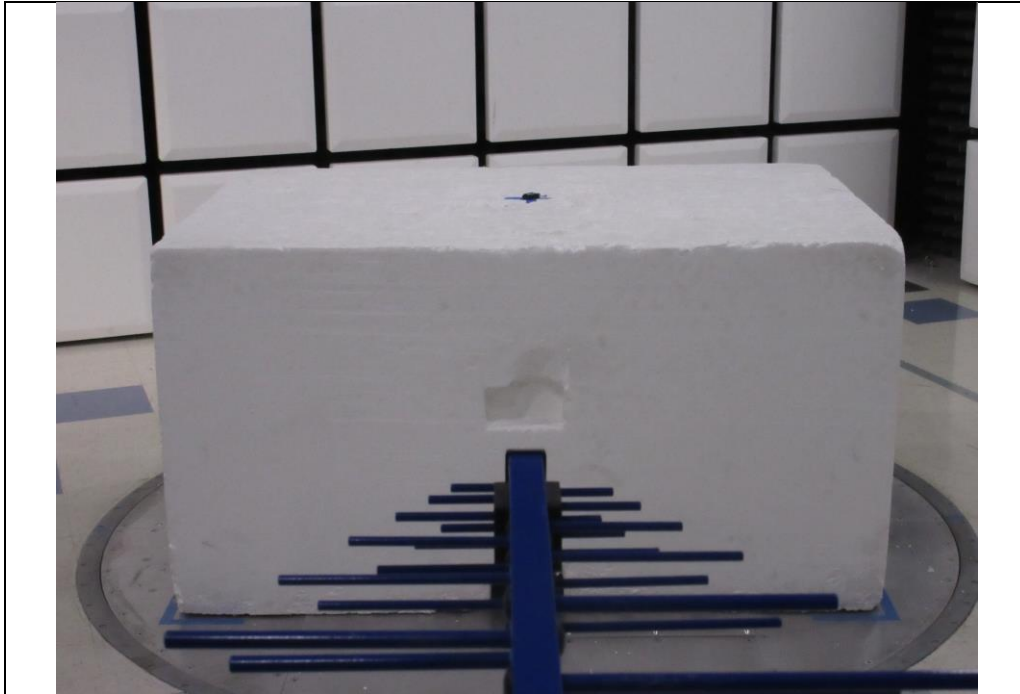
RF Radiated #2