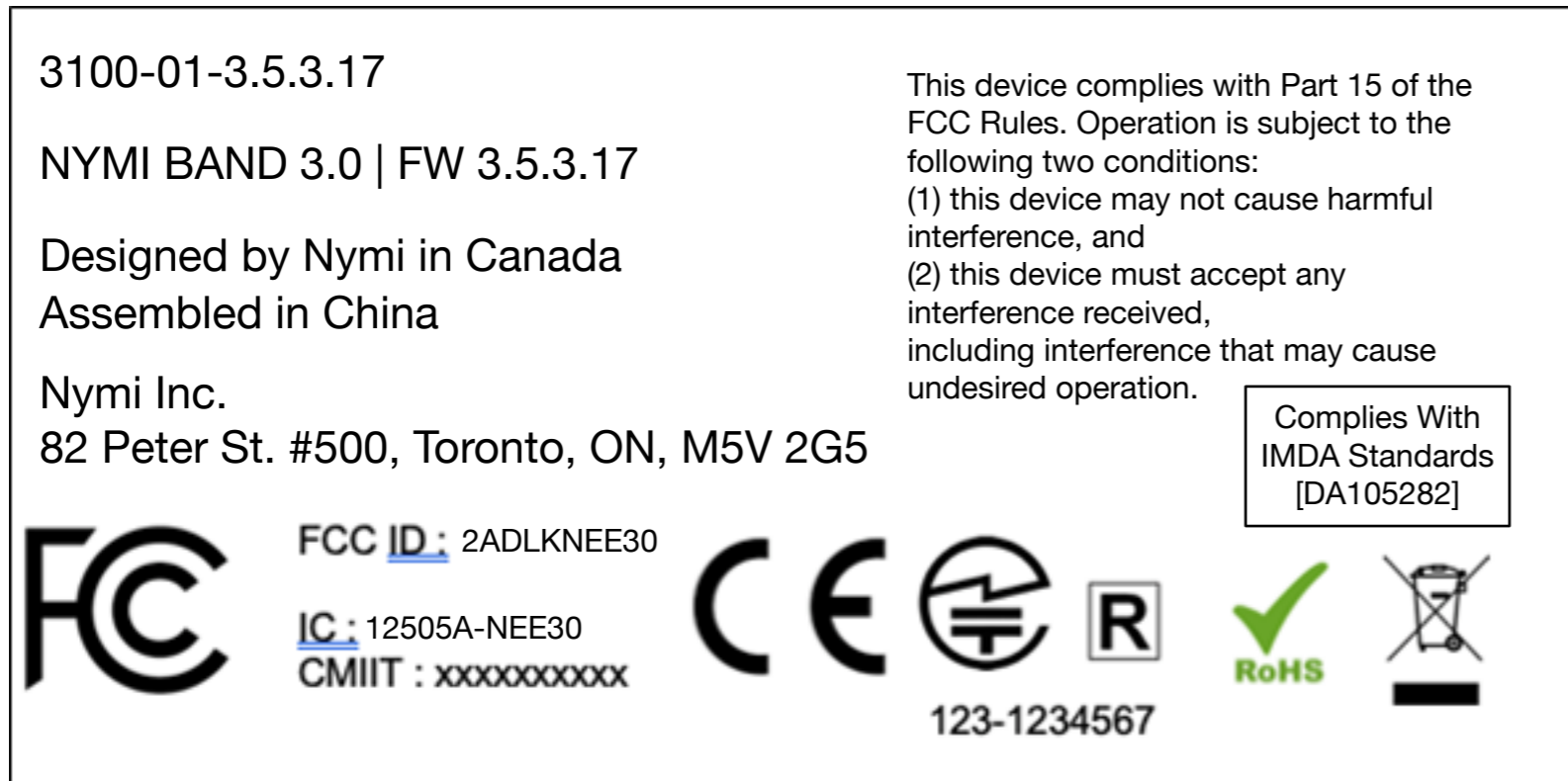
Side 1 - Compliance