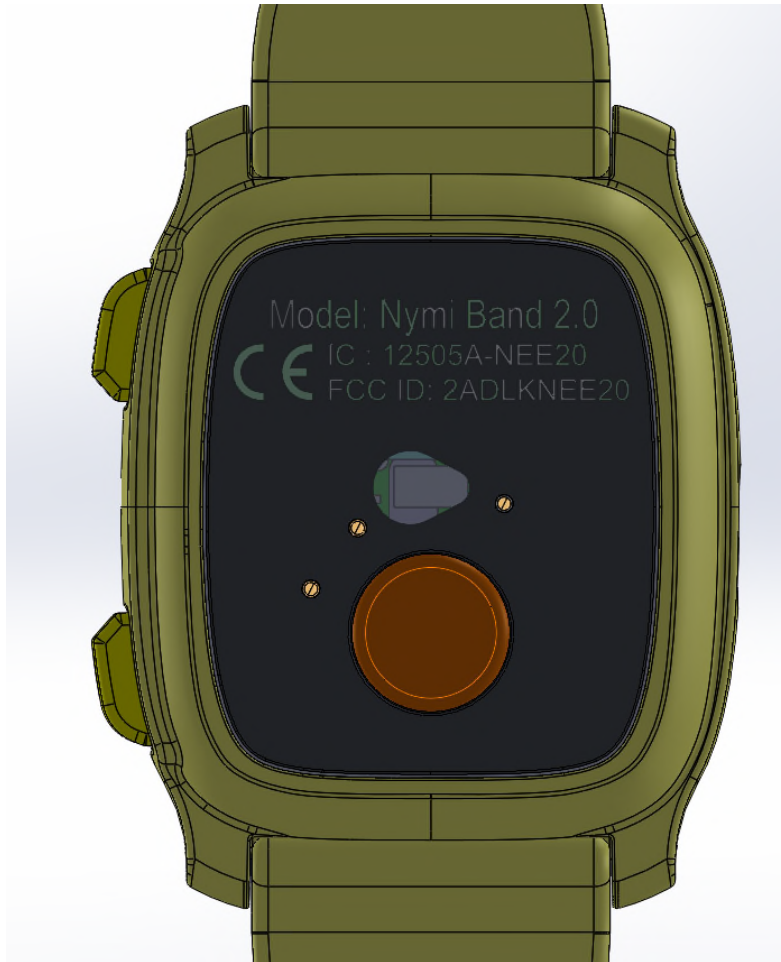
Figure 1 – Sample Label