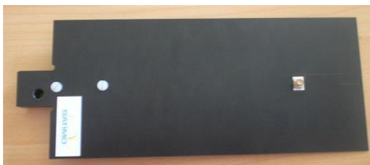
Figure 1 – MVG COMOHAC Validation Dipole

MVG’s COMOHAC Validation Dipoles are built in accordance to the ANSI C63.19 standard. The product is designed for use with the COMOHAC system only.