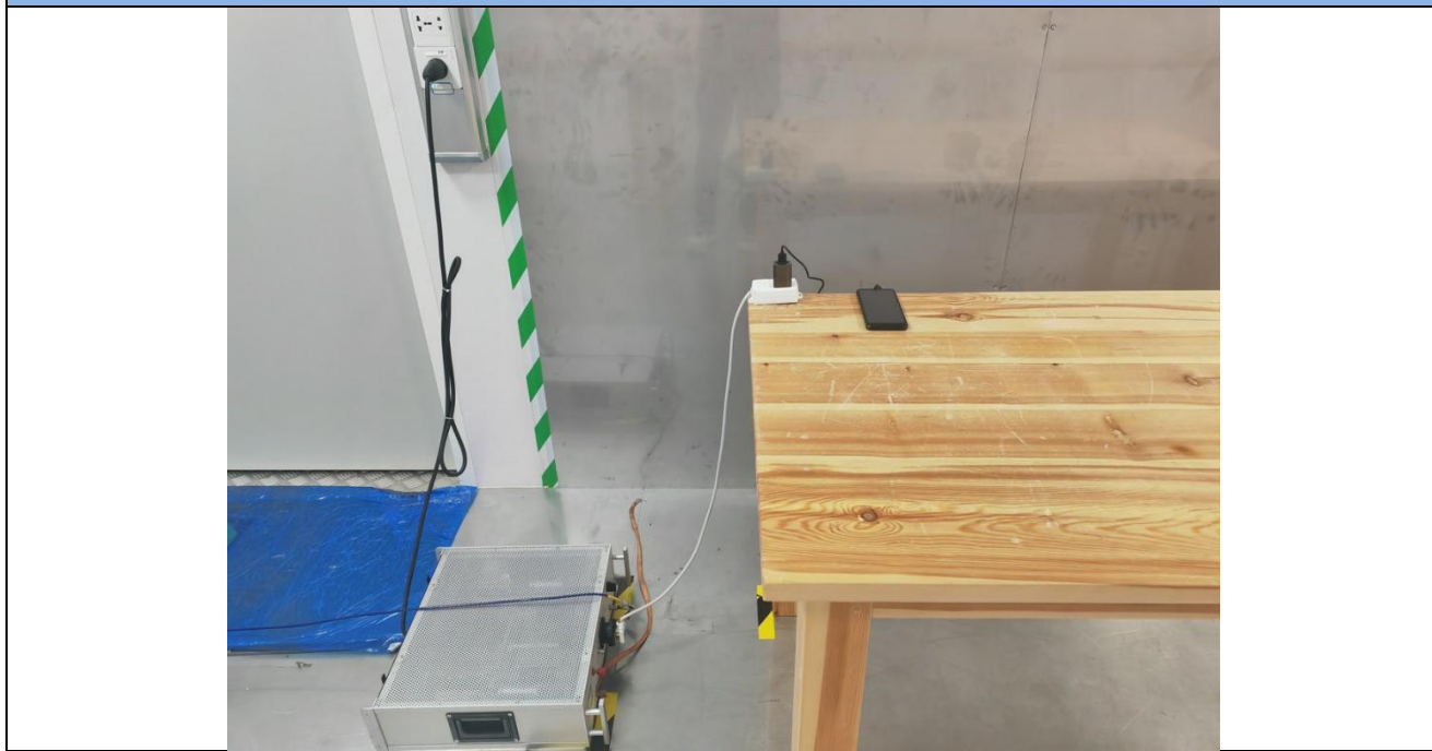
Conducted Emission at AC power line