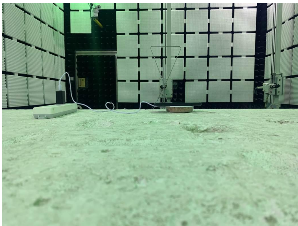
Radiated Emission Below 1 GHz