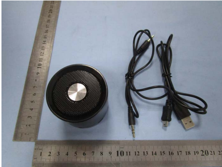
EUT View 2