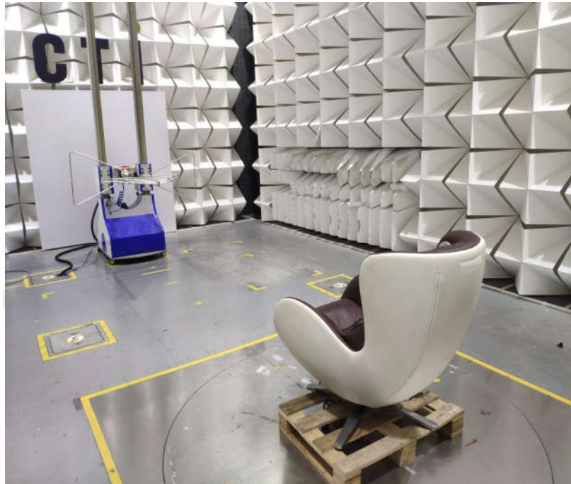
Radiated spurious emission Test Setup-2 (Below 1GHz)