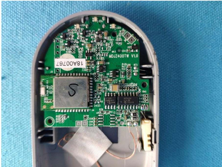
View of Product-7