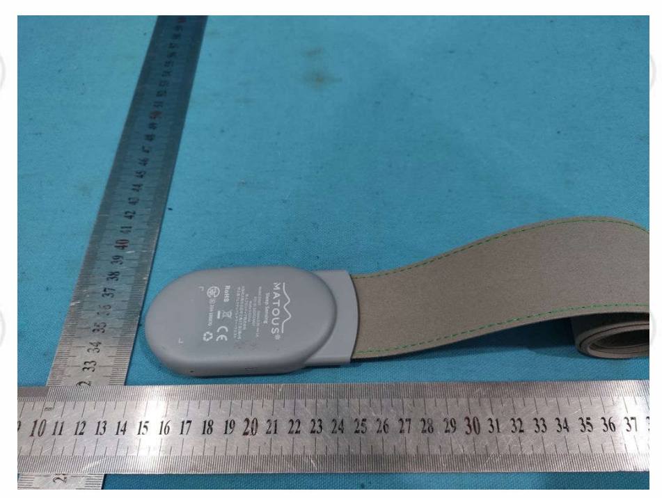
View of product-7

Report No. : EED32N80069301 Page 36 of 45