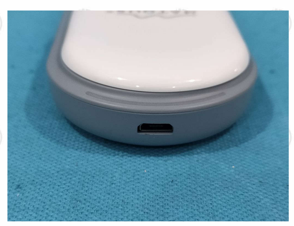
View of product-8