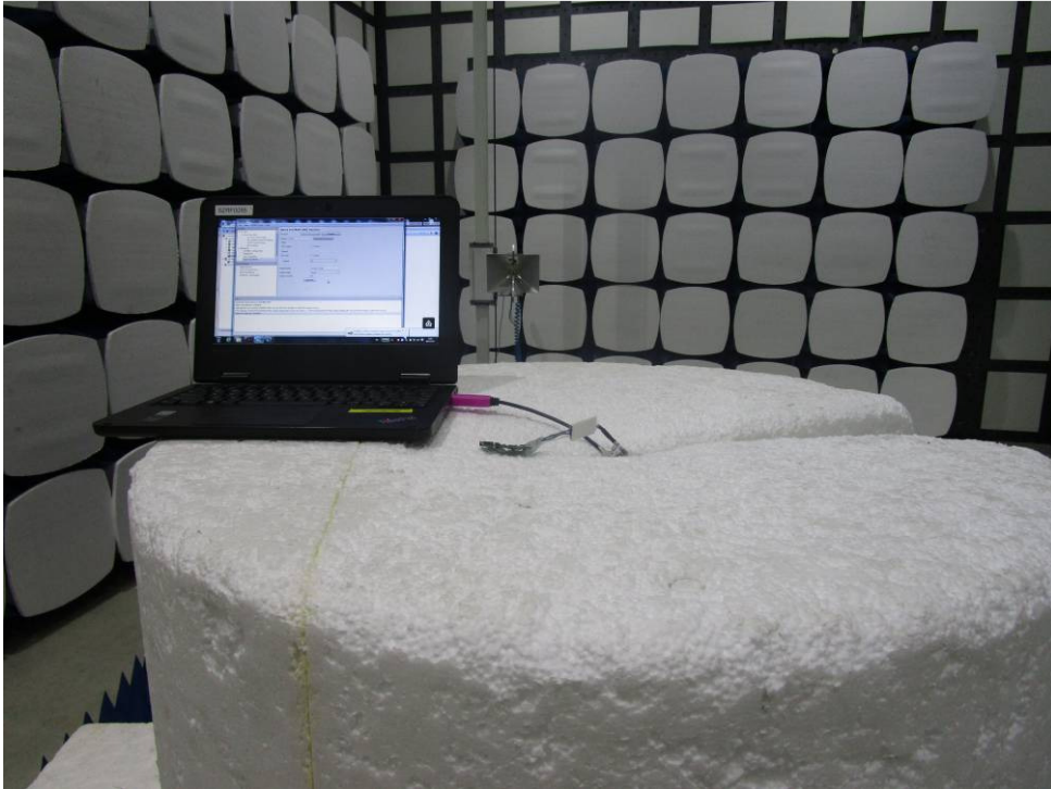
1.4 Radiated Emissions which fall in the restricted bands Tset setup.