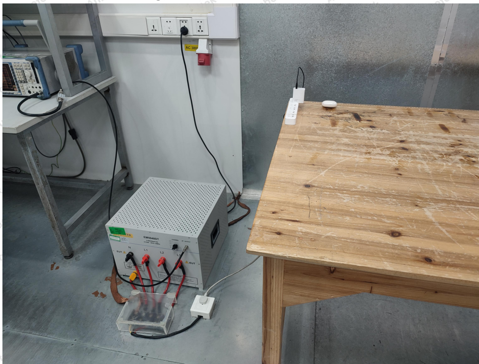
Photo of Radiation Emission Test