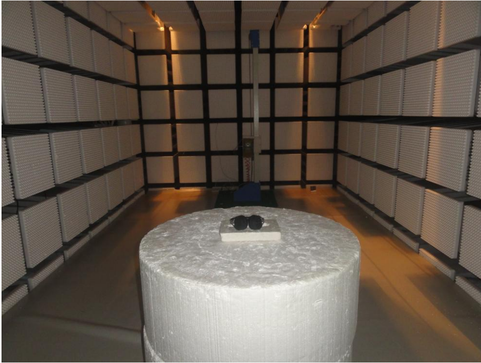
Transmitting spurious emission (Above 1GHz)