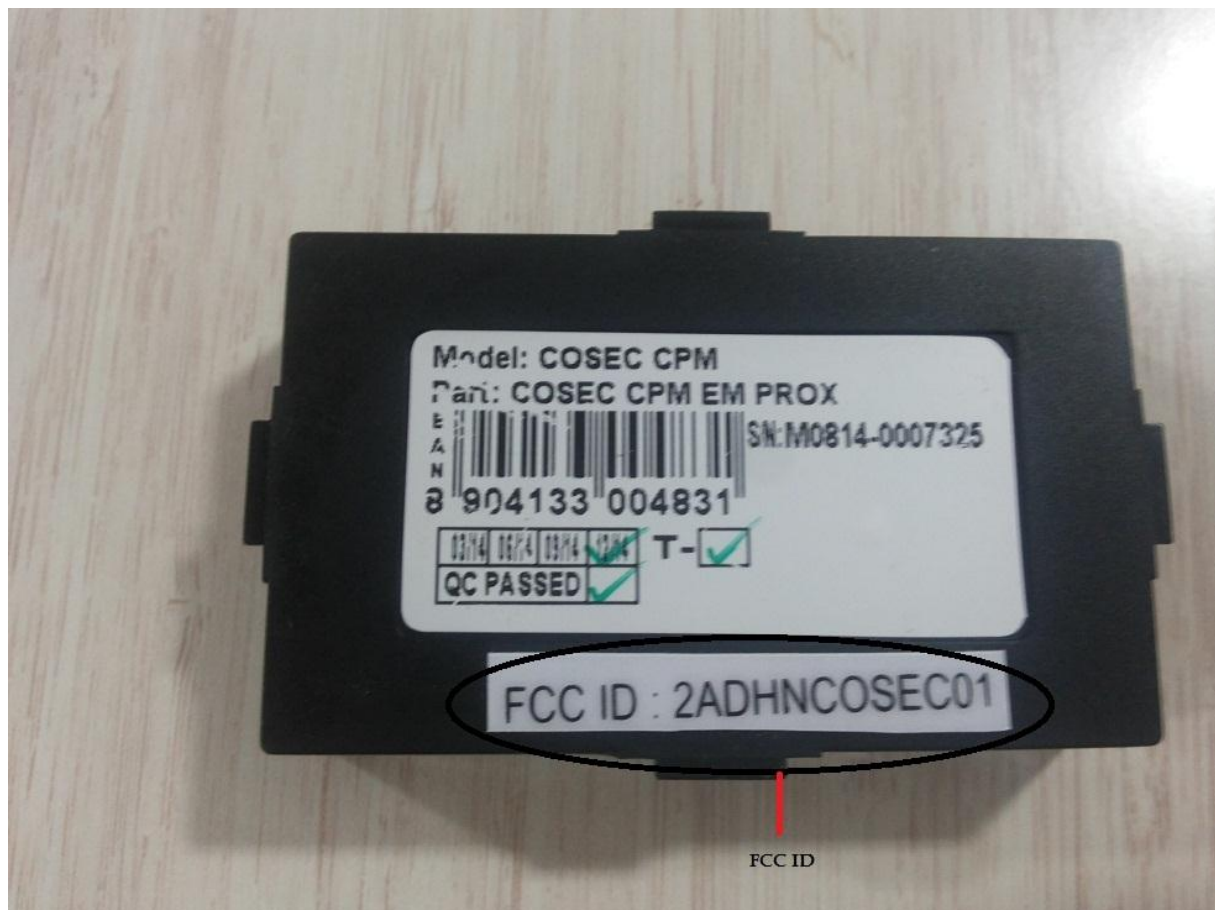
Label Location Diagram