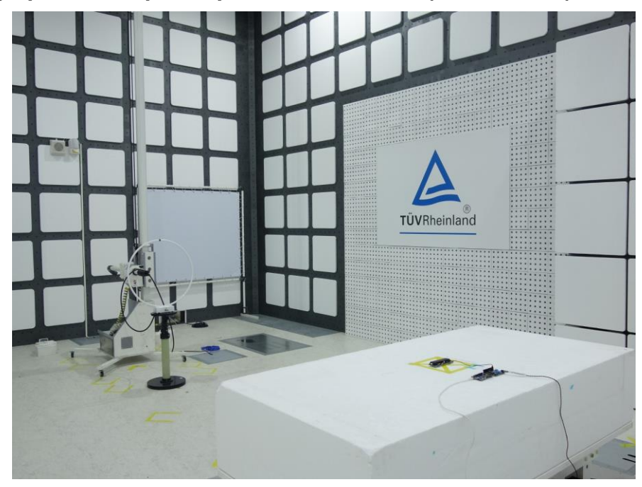
Photograph 4: Set-up for AC Mains (Front View)