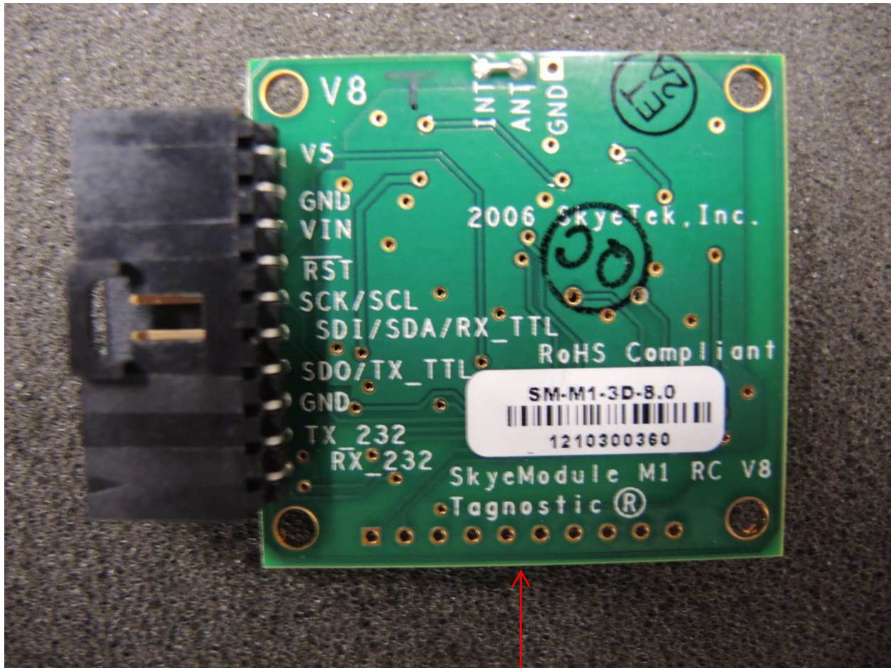
Bottom View: SkyeModule M1

The internal antenna is a single PCB trace that outlines the perimeter of the back of the SkyeModule M1 PCB.