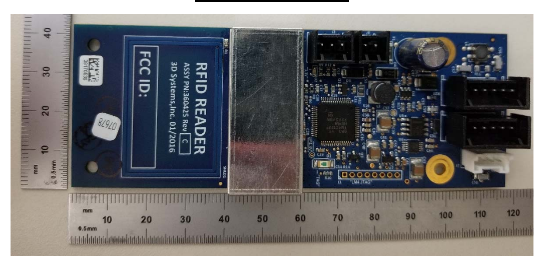
Top view - with EMI shield