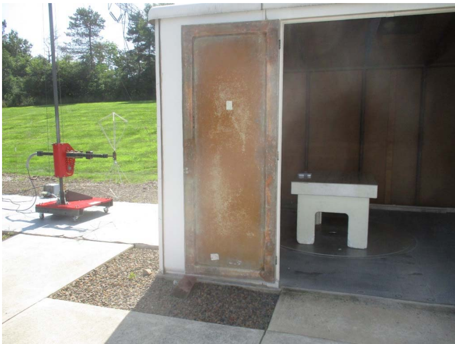
Vertical Polarization, 30 MHz to 200 MHz