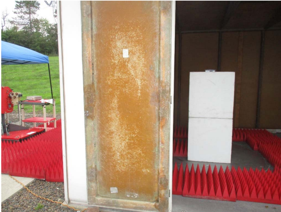
Horizontal Polarization, 18 to 25 GHz