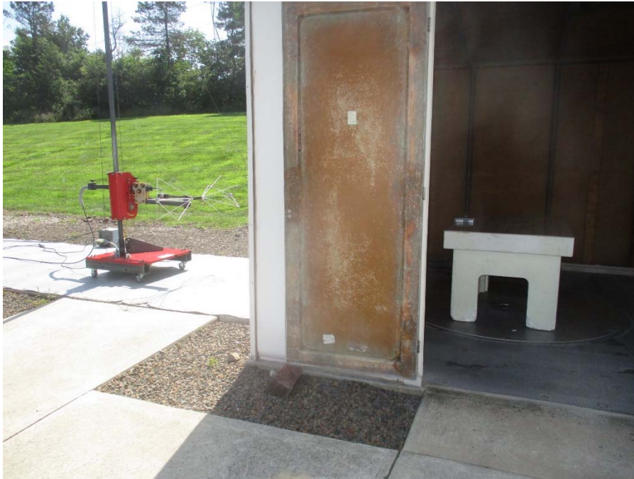
Horizontal Polarization, 30 MHz to 200 MHz