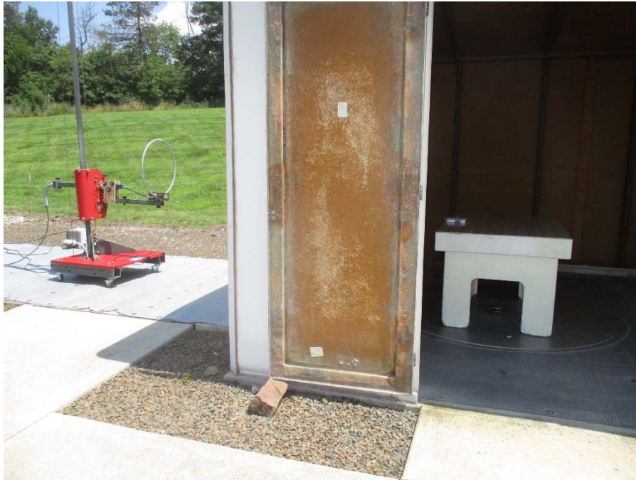
Parallel, 9 kHz to 30 MHz