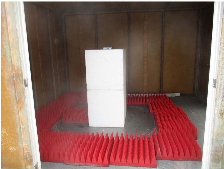
EUT Configuration, Above 1 GHz