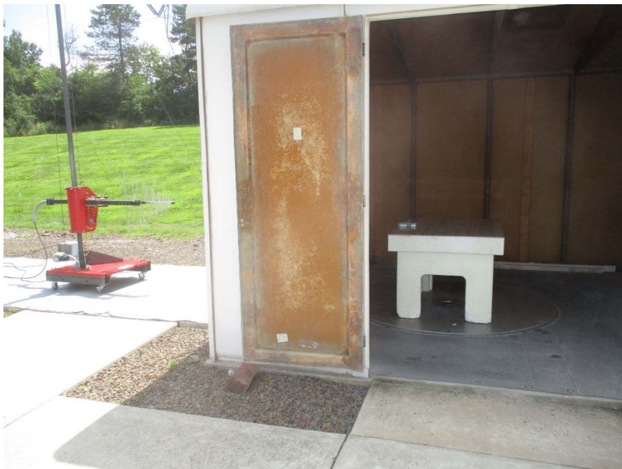
Vertical Polarization, 200 MHz to 1 GHz