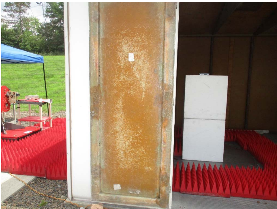
Vertical Polarization, 18 to 25 GHz