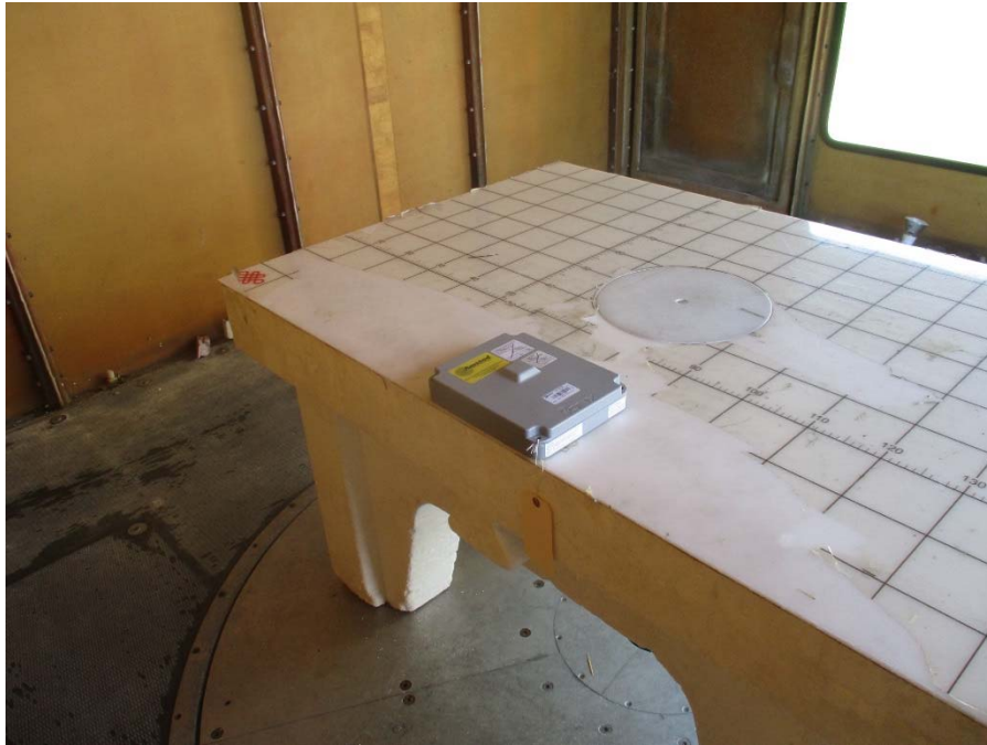
EUT Configuration, Below 1 GHz