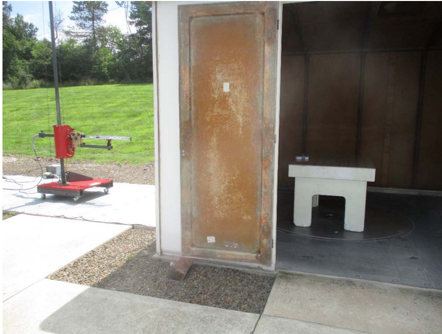
Horizontal Polarization, 200 MHz to 1 GHz