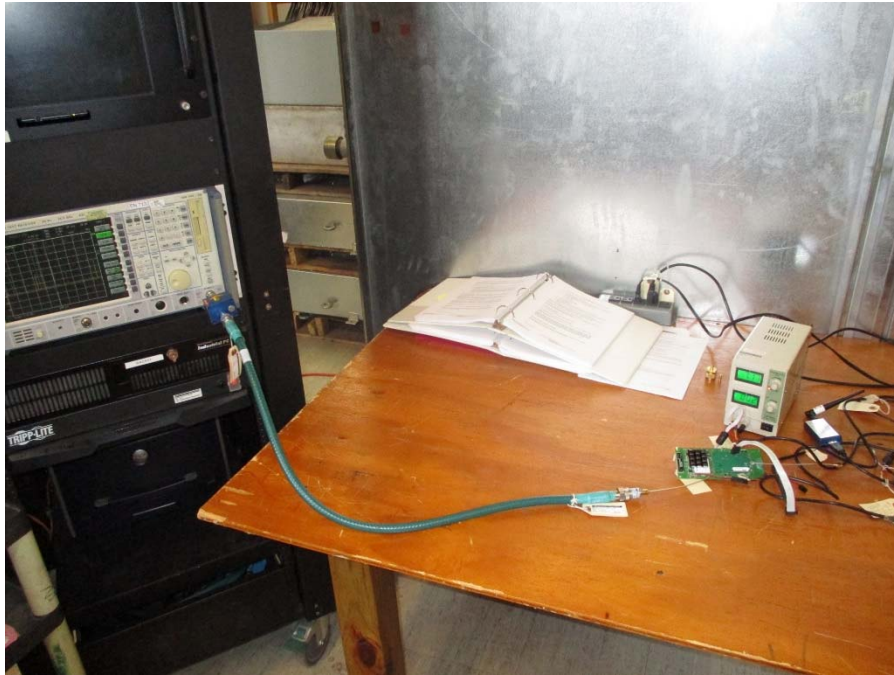
Test Setup, 30 MHz to 18 GHz