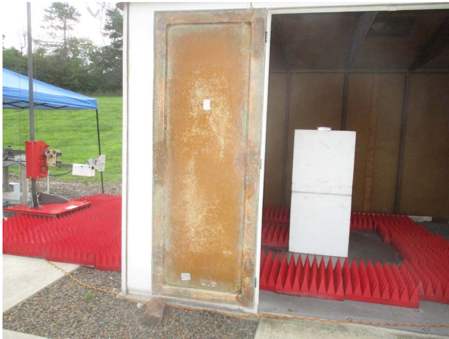
Horizontal Polarization, 1 to 18 GHz