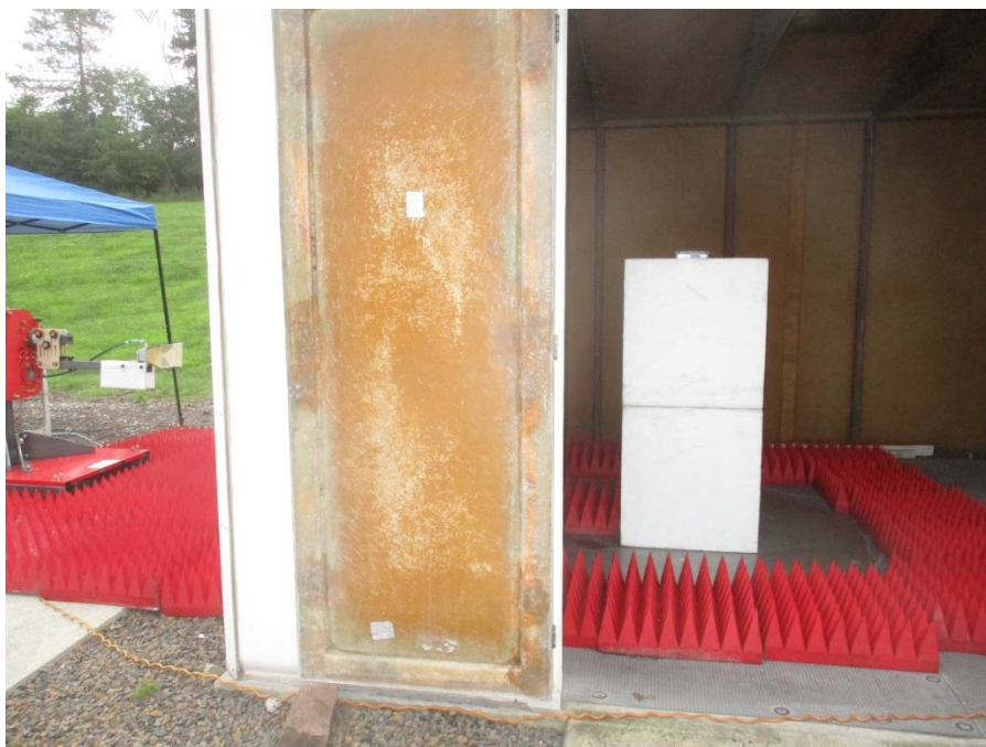
Vertical Polarization, 1 to 18 GHz