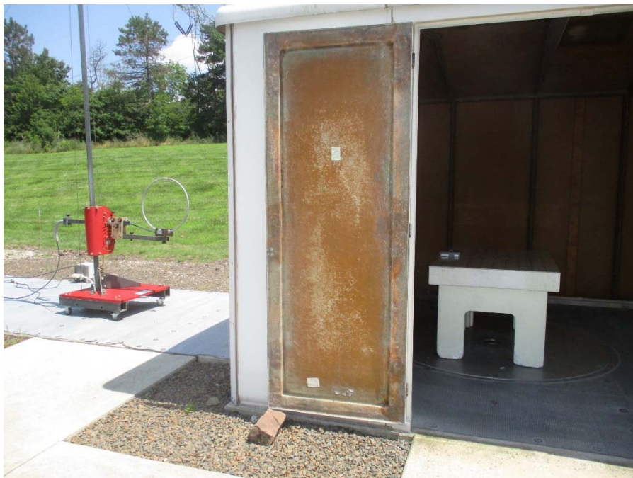
Perpendicular, 9 kHz to 30 MHz