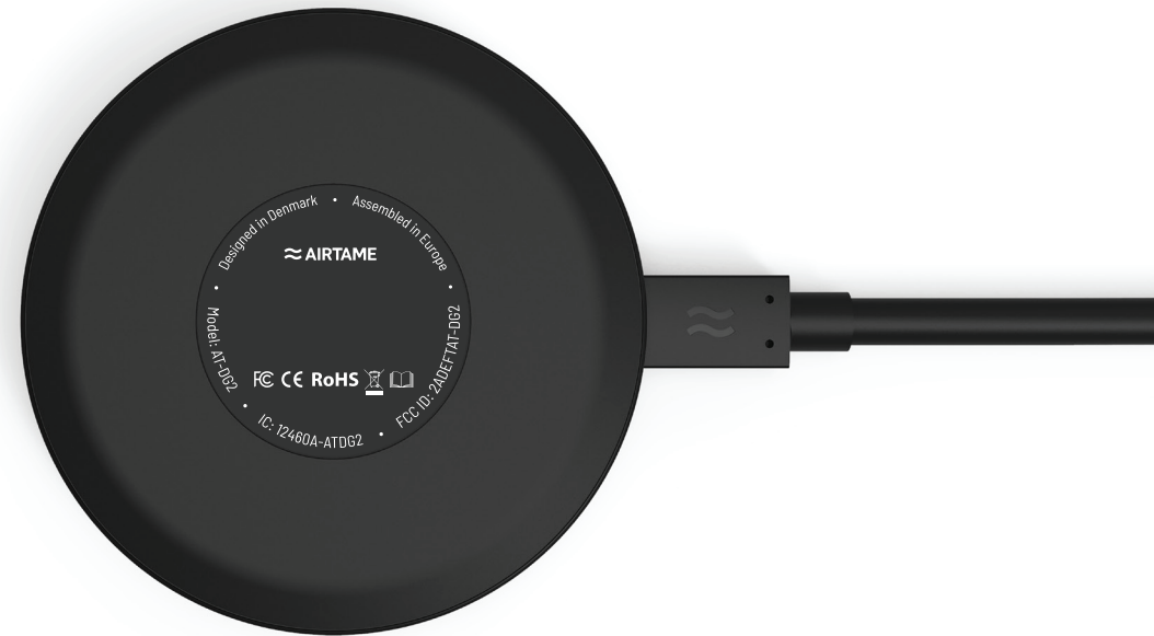
Illustration of print on the device