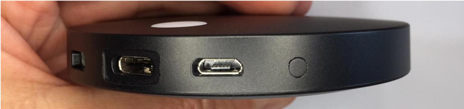
Inlet ports (USB-C, Micro USB), Kensington slot and reset button