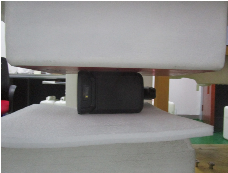
Bottom Side Setup Photo