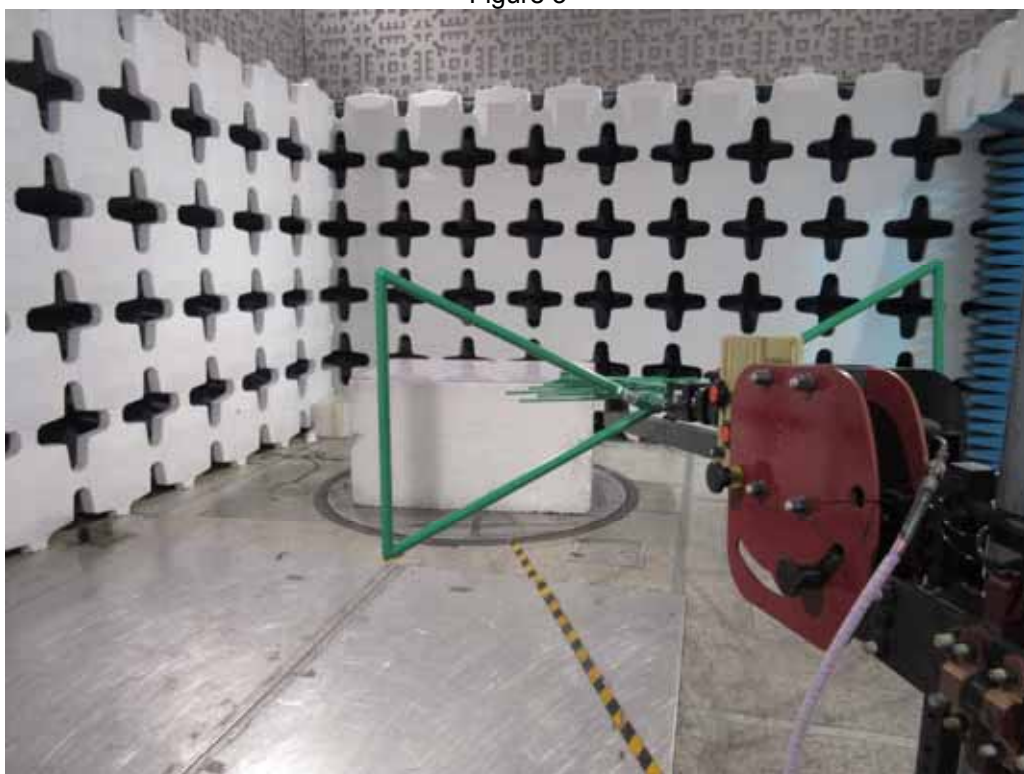
Test Setup for Radiated Emissions, 30MHz to 1GHz – Horizontal Polarization