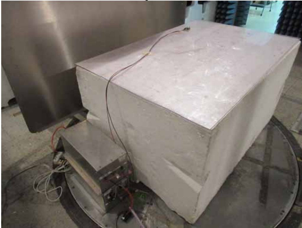
Test Setup for Conducted Emissions