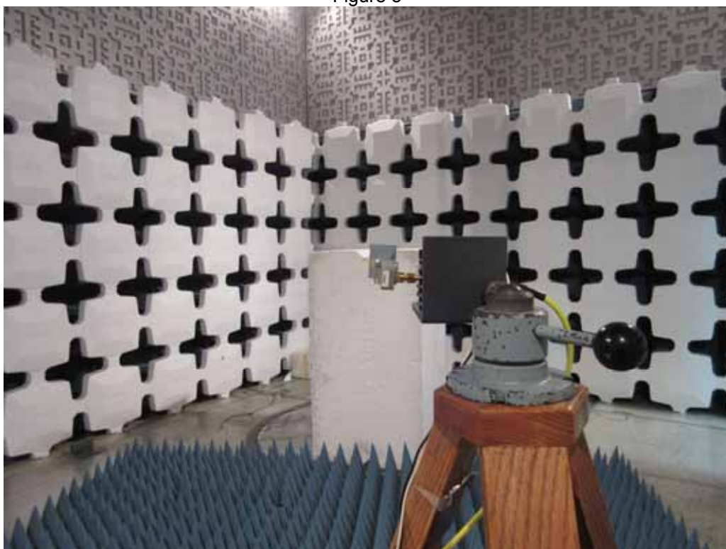
Test Setup for Radiated Emissions, 18 to 25GHz – Horizontal Polarization