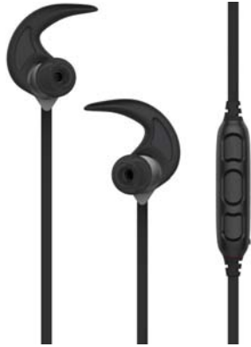
Magnet-control power on/off bluetooth earphones User's Manual