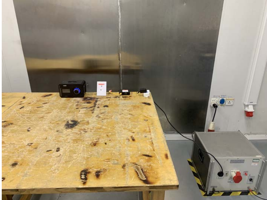
Test Site 1#