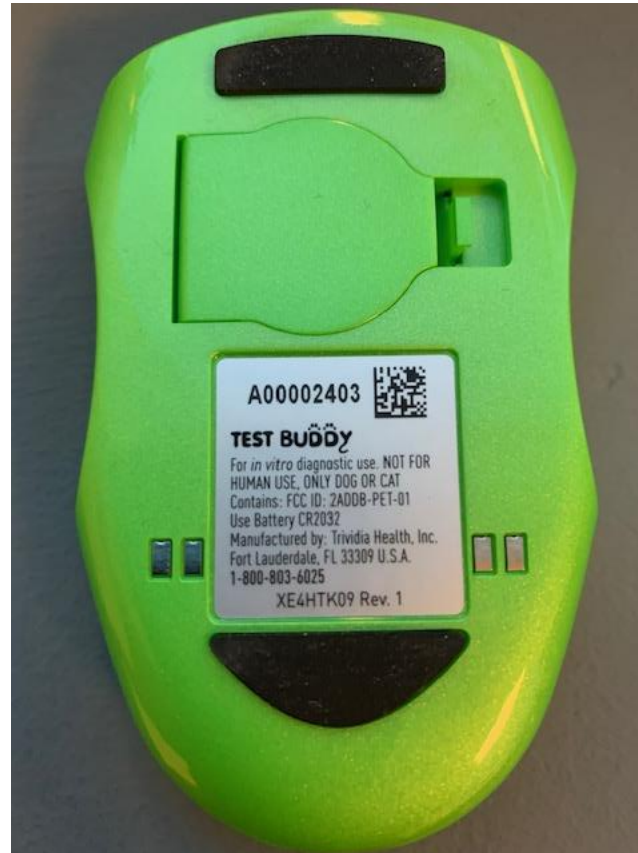
Exhibit 1. Label ID Position on Device