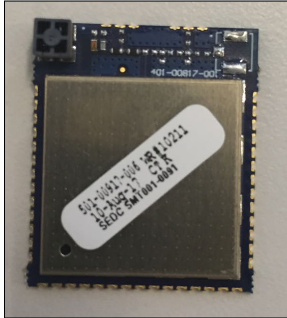
Figure 1: Front with Shield