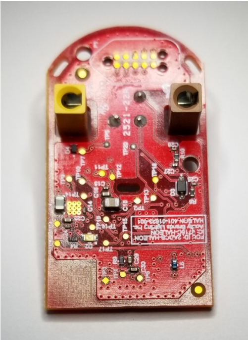
Module Label Picture

FCC ID: 2ADCB-HALEON IC: 6715C-HALEON Acuity Brands Lighting Inc. HALEON 921-01623-001