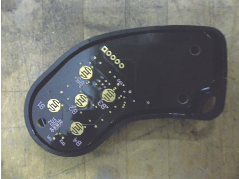
Figure 2. EUT with Top External Case and Buttons Removed

FCC Part 15.249/RSS 210 14-0273 Acuity Brands Lighting 2ADCB-DTL02 6715C-DTL02 November 7, 2014 DTL02