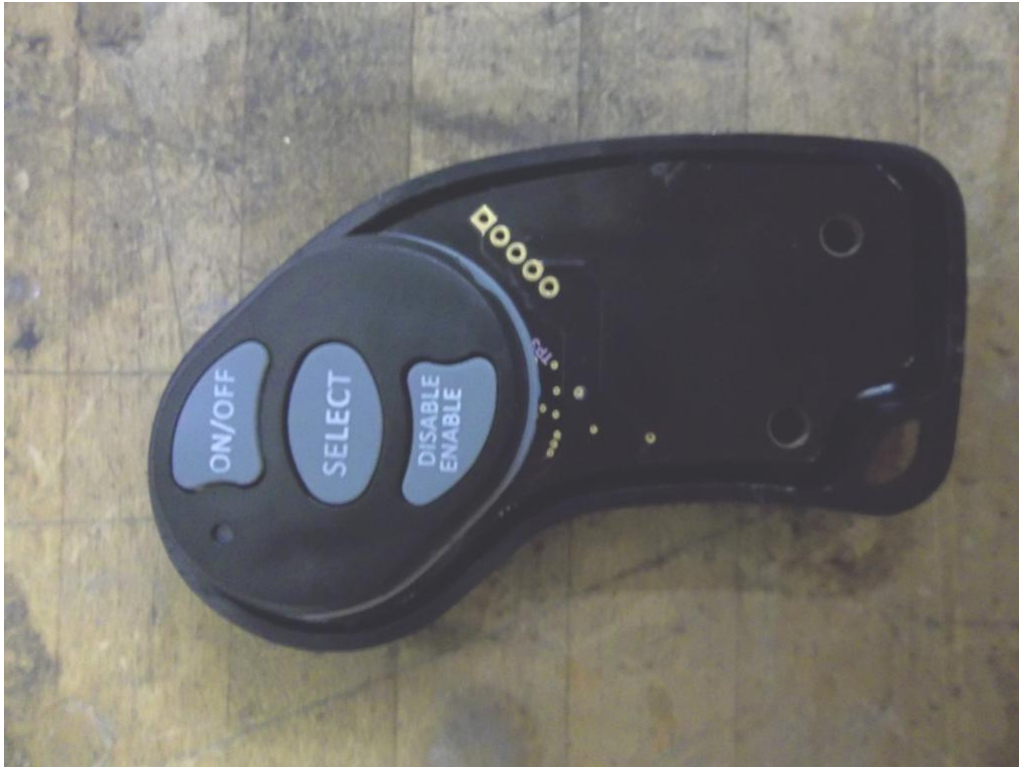
Figure 1. EUT with Top External Case Removed