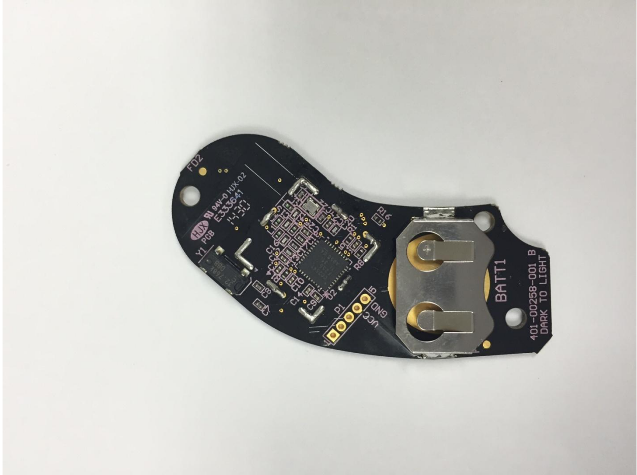
Figure4. Back of EUT with Shielding Removed

FCC Part 15.249/RSS 210 14-0273 Acuity Brands Lighting 2ADCB-DTL02 6715C-DTL02 November 7, 2014 DTL02