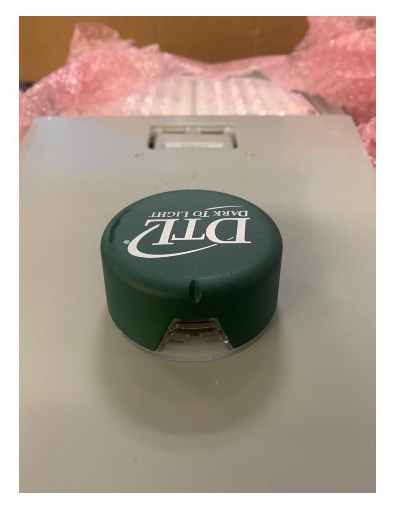
Figure 3: View 3