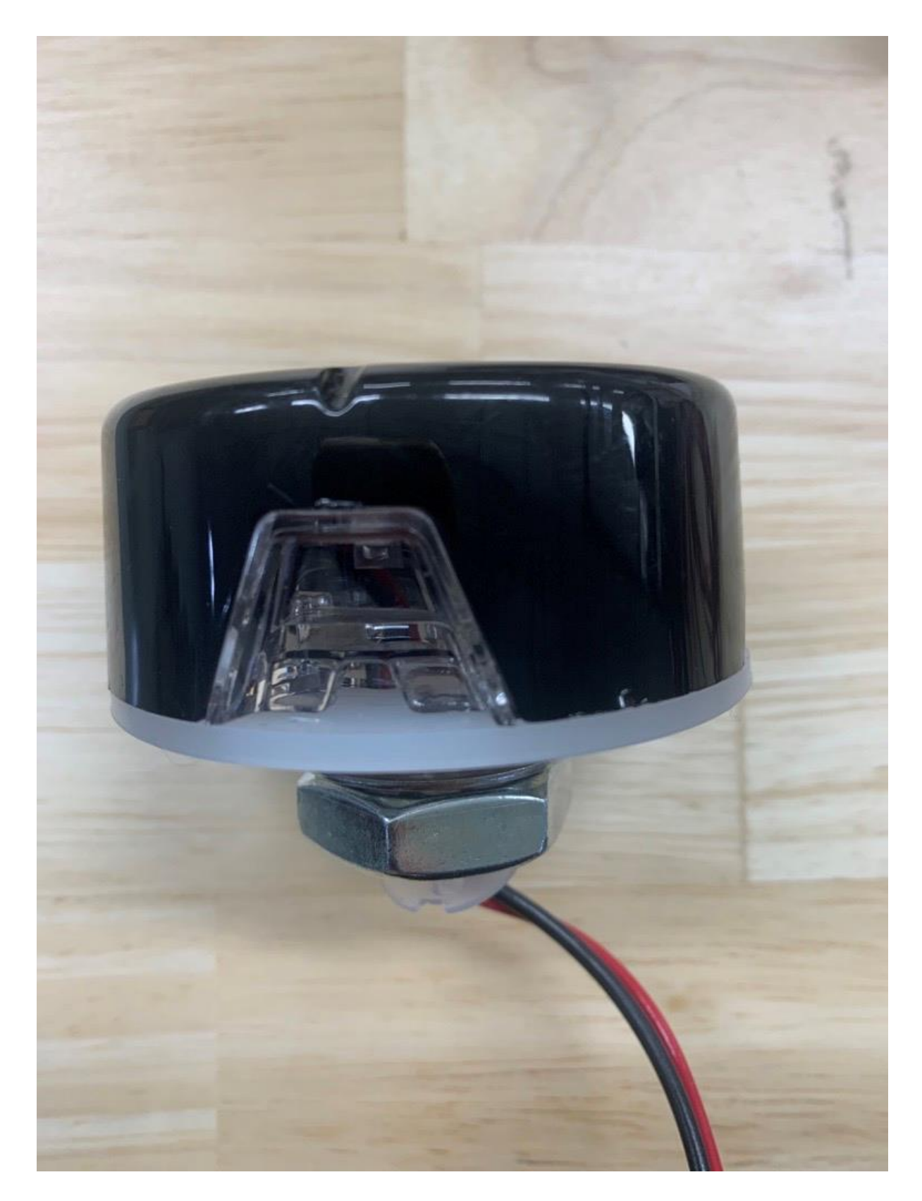
Figure 1: View 1