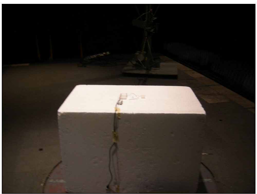
Figure 2: Radiated Emissions– XPOS