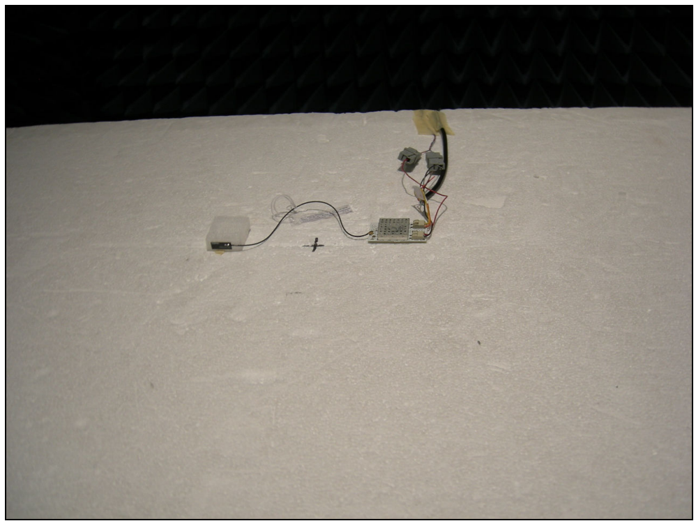
Figure 5: Radiated Emissions- ZPOS