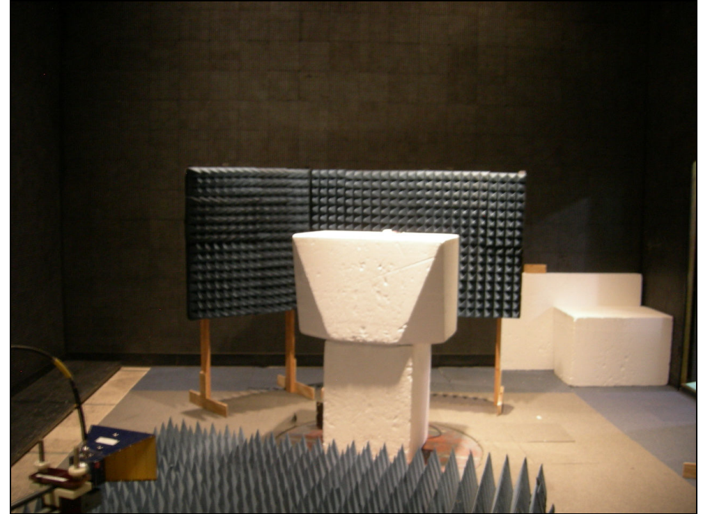
Figure 1: Radiated Emissions – XPOS