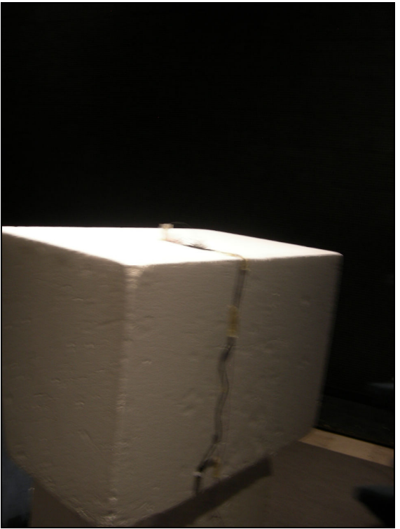
Figure 4: Radiated Emissions– YPOS