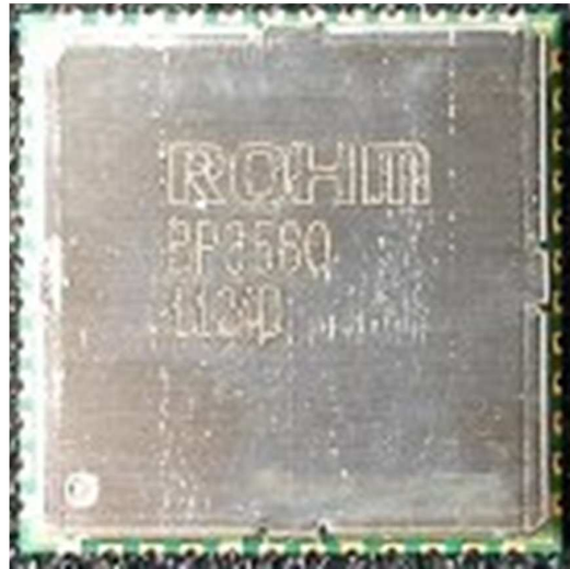
Side A with Shield