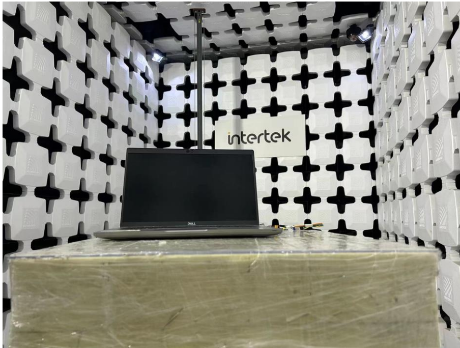
Back View (Above 1GHz)