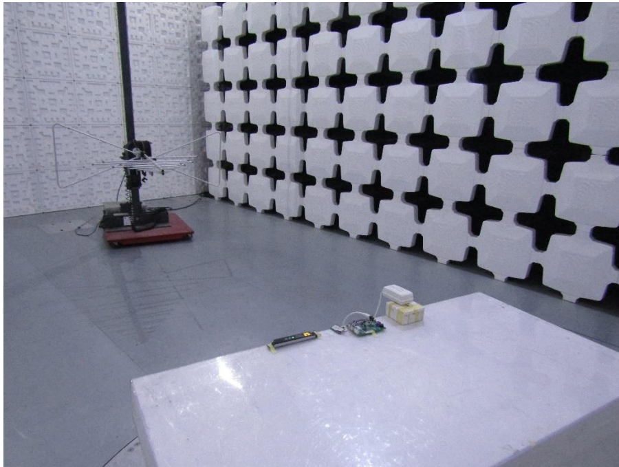
Radiated Emission (30MHz-1GHz)