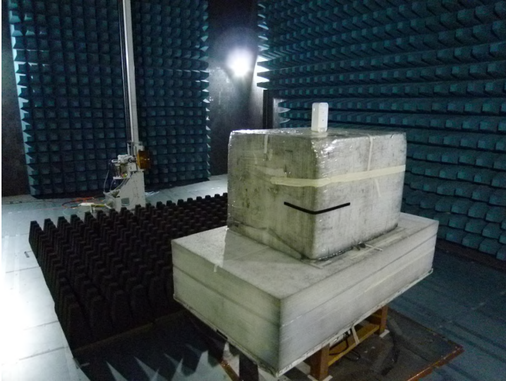
Radiated Emission Set up Photos (Front View)