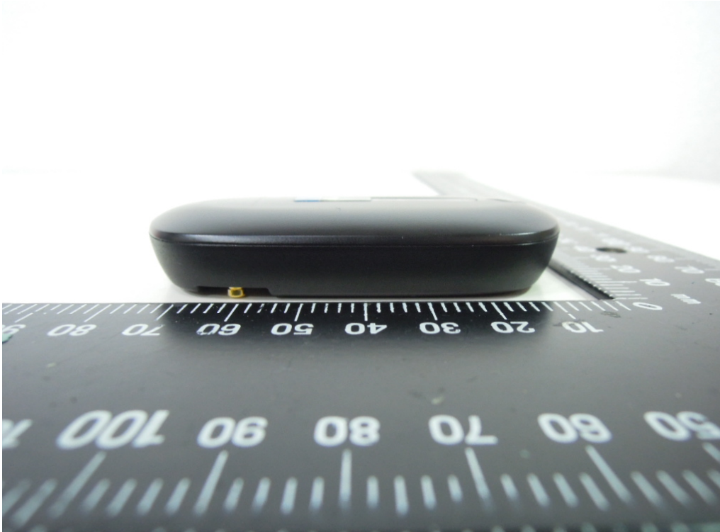
Side View of EUT – 3