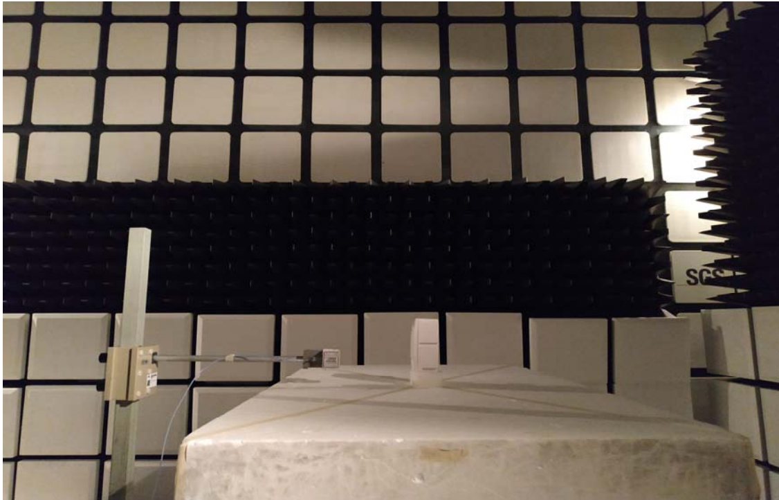
Radiated Emission Set up Photos (Front View)